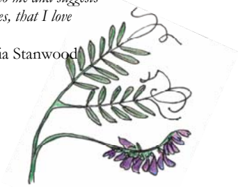
Cow Vetch, Vicia cracca