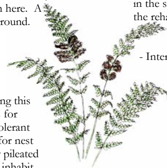
- Interrupted Fern, Osmunda claytoniana

Beyond the Boardwalk... Cordelia's observations took her to every corner of Birdsacre's original 40 acres. Today the sanctuary encompasses 200 acres of woodlands, forest, and meadows. Follow the color-coded map to walk various trails. A site map is available in the small building in the parking lot. Observe birds in the rehabilitation enclosures located in the sanctuary.