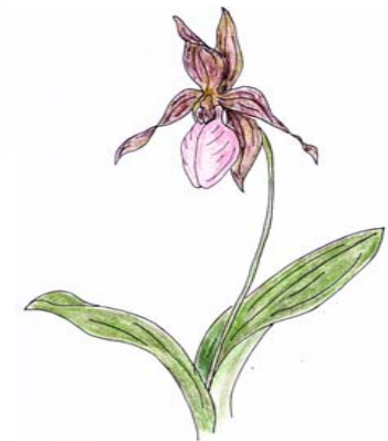
Pink Lady Slipper, Cypripedium acaule