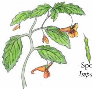
-Spotted Jewelweed, Impatiens capensis

The goal is to create a woodland garden which is accessible, educational, and enjoyable for all members of the community. Photos of plants found along the boardwalk are available for viewing inside the nature center. Center hours vary.